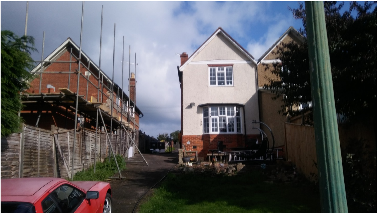
Photo taken from patio to the rear of 77 Henley Road. (N.B. this was taken during withdrawn application 171302, when the ground floor extension was still under construction)

Photo taken from garden of 81 Henley Road (N.B. this was taken during withdrawn application 171302, when the ground floor extension was still under construction)